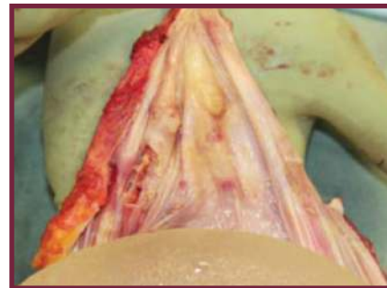
Figure 1. Example of BI-ALCL presentation with right breast swelling. Capsule appearance of BI-ALCL mass.

This joint statement was prepared by ASPS and ASAPS.